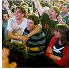
Best Man Wanted. Must Be Rush Fan.