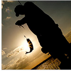
Luxe Meets the Lake in 'Real' Florida