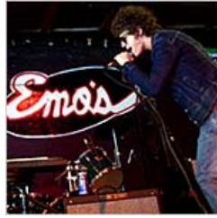
Finding Fame in Austin in the Internet Age