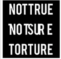
Letters: On Torture and the Rule of Law