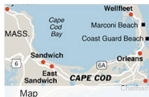
Cape Cod, Mass

There is a symphony of cold in sound: A lone seagull dives for an errant fish offshore, a far-off splash echoing across the emptiness of gray and blue. Frozen ice and sand crackle underfoot as a golden retriever bounds along the beach. The gentle whistle of icy breath, the muffled scratch of a coat collar pulled tight around the neck.