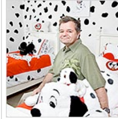
Everybody Into the Rental Pool